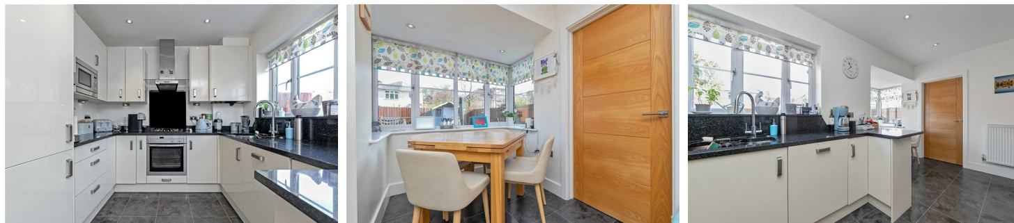
Ground Floor Approx. 636.5 sq. feet

Nestled in the desirable Damson Close, Watford, this modern semi-detached house offers a perfect blend of comfort and style. Spanning an impressive 1,502 square feet, the property boasts four well-proportioned bedrooms, making it an ideal family home. The two reception rooms provide ample space for relaxation and entertaining, ensuring that there is room for everyone to enjoy. The house is in lovely condition, reflecting contemporary design and thoughtful finishes throughout. With two bathrooms, morning routines will be a breeze, accommodating the needs of a busy household. The modern development enhances the appeal of this property, providing a welcoming environment for families and professionals alike. Additionally, the property features a garage, offering convenient storage or parking options. This semi-detached home is not only spacious but also benefits from a well-planned layout that maximises natural light and creates a warm atmosphere. Situated in a sought-after area, this home is close to local amenities, schools, and transport links, making it a practical choice for those looking to settle in Watford. Whether you are seeking a family residence or a stylish space to call your own, this property on Damson Close is sure to impress. Don't miss the opportunity to make this lovely house your new home.